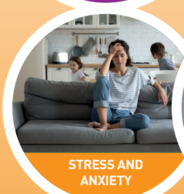
STRESS AND ANXIETY