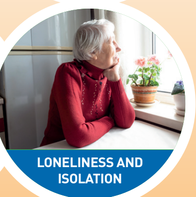
LONELINESS AND ISOLATION